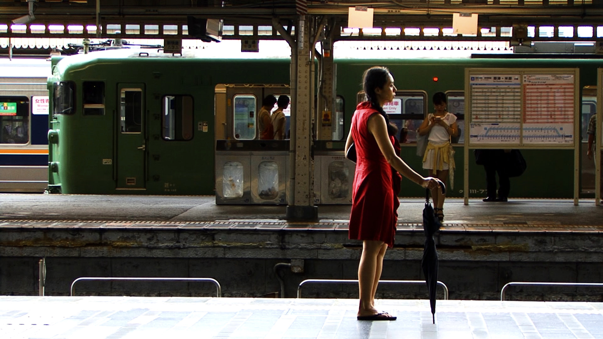
Still from Kyoka Tskamoto's film Creation and Sacrifice , 2016