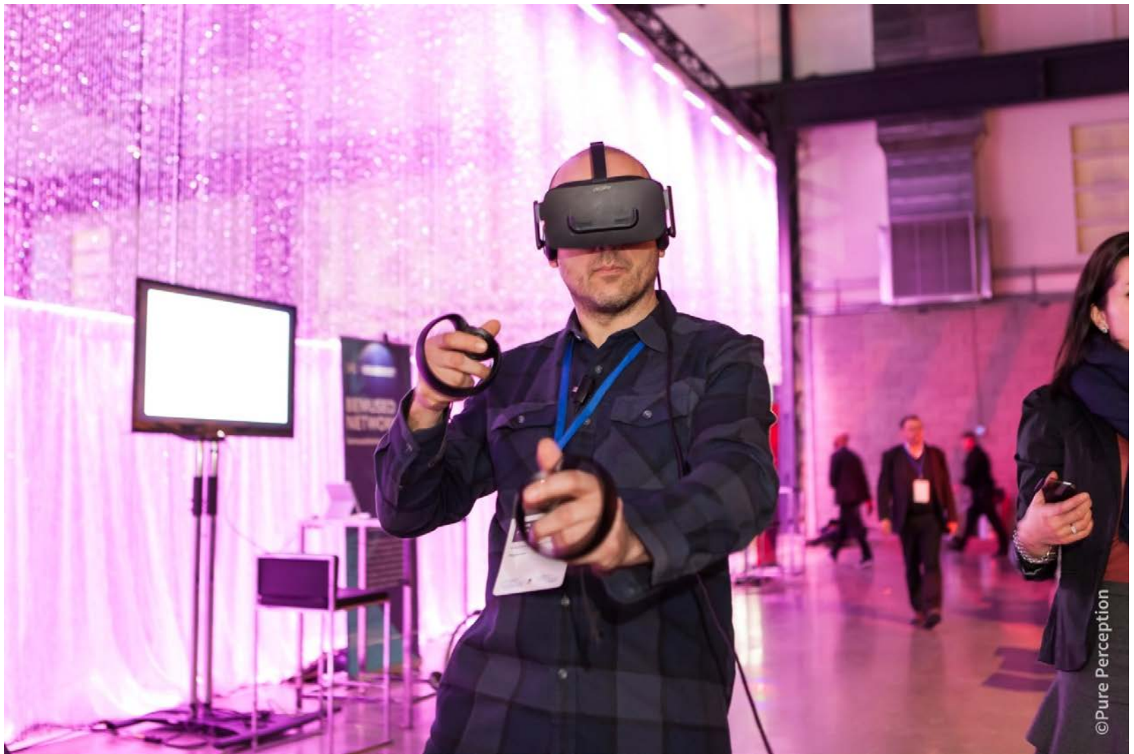
From the Arts in a Digital World Summit, hosted by the Canada Council for the Arts, March 2016