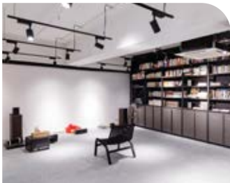
泛亞中心 — 902工作室 Pan Asia Centre - Studio 902