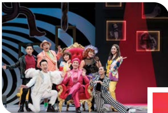
香港大歌劇院有限公司《芝麻經理人》 L'impresario in angustie by Hong Kong Grand Opera Company Limited