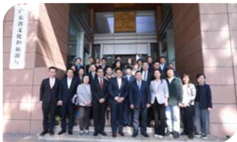
拜訪廣東省文化和旅遊廳 Visit to the Department of Culture and Tourism of Guangdong Province