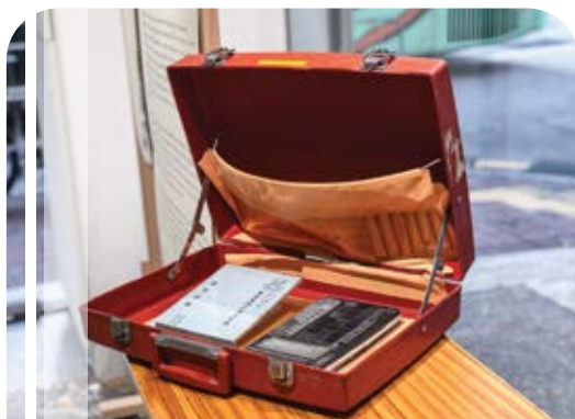
香港活字館展品 An exhibit at Hong Kong Open Press