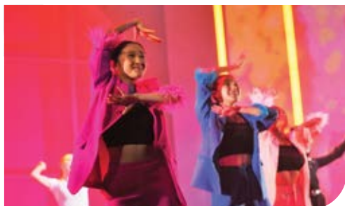
香港青年藝術協會《I'mperfect》 I'mperfect by Hong Kong Youth Arts Foundation