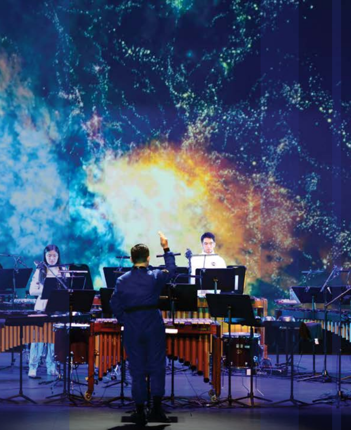
敲擊裏《航太裏旅》 Toolbox Long March by Toolbox Percussion