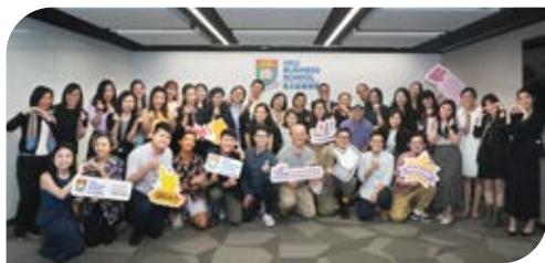
高級行政領袖發展培訓計劃 2023 Executive Leadership Development Programme 2023