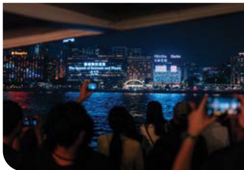
Resonant Harbour: A Speculative Water Tour