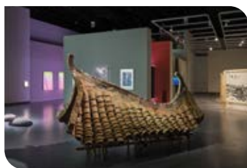
開幕展覽《南區旁注》 Opening Exhibition Marginal Notes