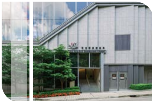
藝發局Landmark South新址 HKADC's new premises at Landmark South