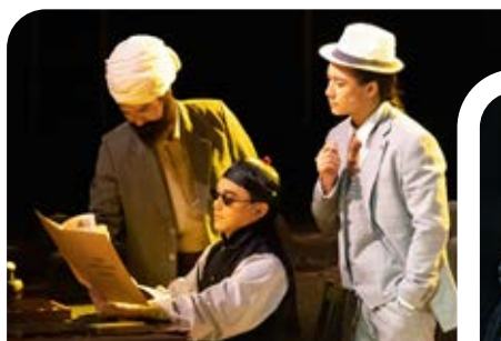
劇場空間《神探福邊，字摩斯》 House of Detectives – Hong Kong Remakes by Theatre Space