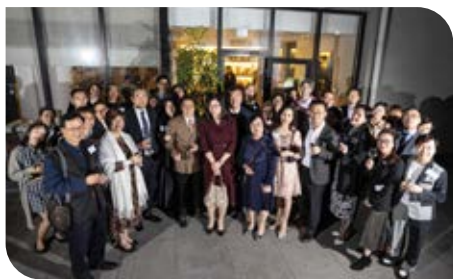
交流晚宴 Reception Dinner