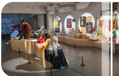
白盒展覽 Exhibition at the White Box