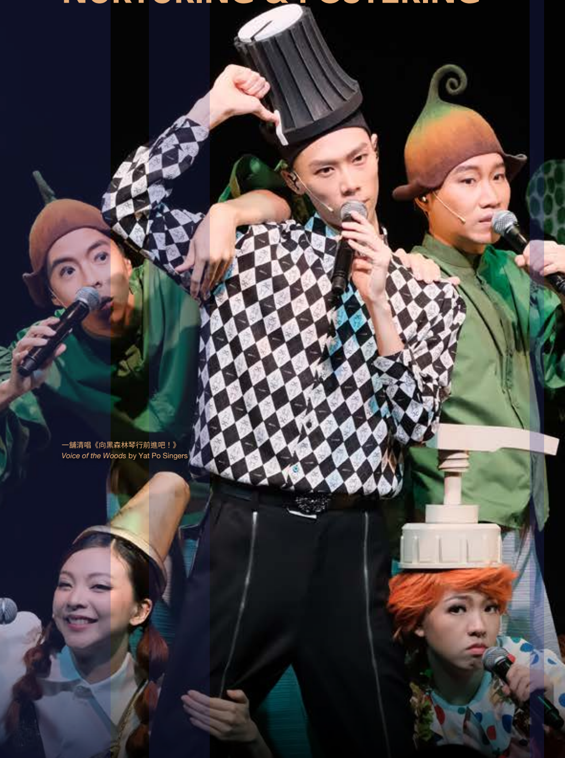
一舖清唱《向黑森林琴行前進吧！》 Voice of the Woods by Yat Po Singers