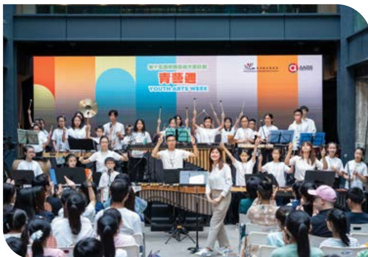
創意工作坊 Creative Workshop