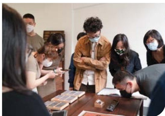
「散落·尋回·香港字」分享會 Sharing Session by Hong Kong Open Press Group