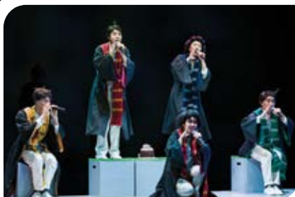
一舖清唱《一舖兩劇》 Yat Po Two Shows by Yat Po Singers