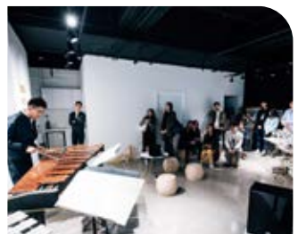
柏秀中心 — 敲擊裏有限公司 Po Shau Centre - Toolbox Percussion Limited