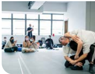
創匯國際中心 — 新約舞流有限公司 The Globe - Passoverdance Limited